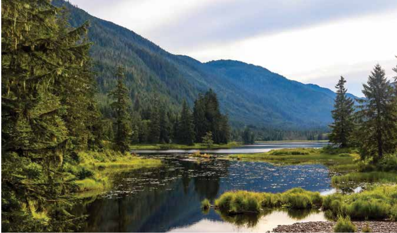
Tongass National Forest, Alaska