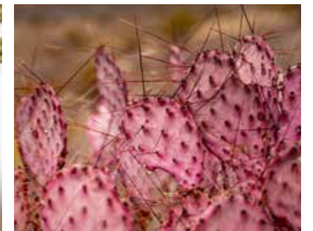
(Left) Roadrunner at the Rio Grande river, (Center) Cactus Wren on a Cholla in the Chisos Mountains, (Right) Purple Tinged Prickly Pear Cactus