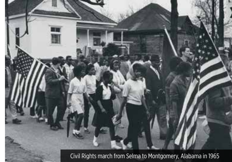
Civil Rights march from Selma to Montgomery, Alabama in 1965

5 Start the day at the Mississippi Civil Rights Museum , which features a series of galleries on the history of the civil rights movement, featuring the stories of Emmett Till , Medgar Evers and many others. From there, drive to the COFO Civil Rights Education Center to meet with a historian whose expertise is on the modern civil rights movement