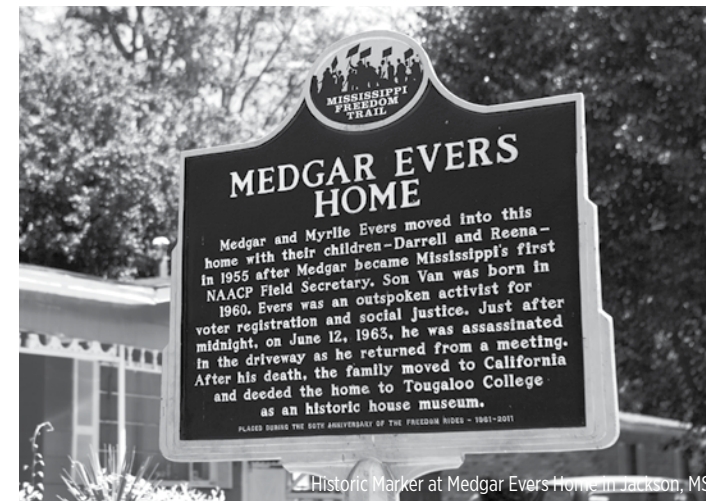
Historic Marker at Medgar Evers Home in Jackson, MS