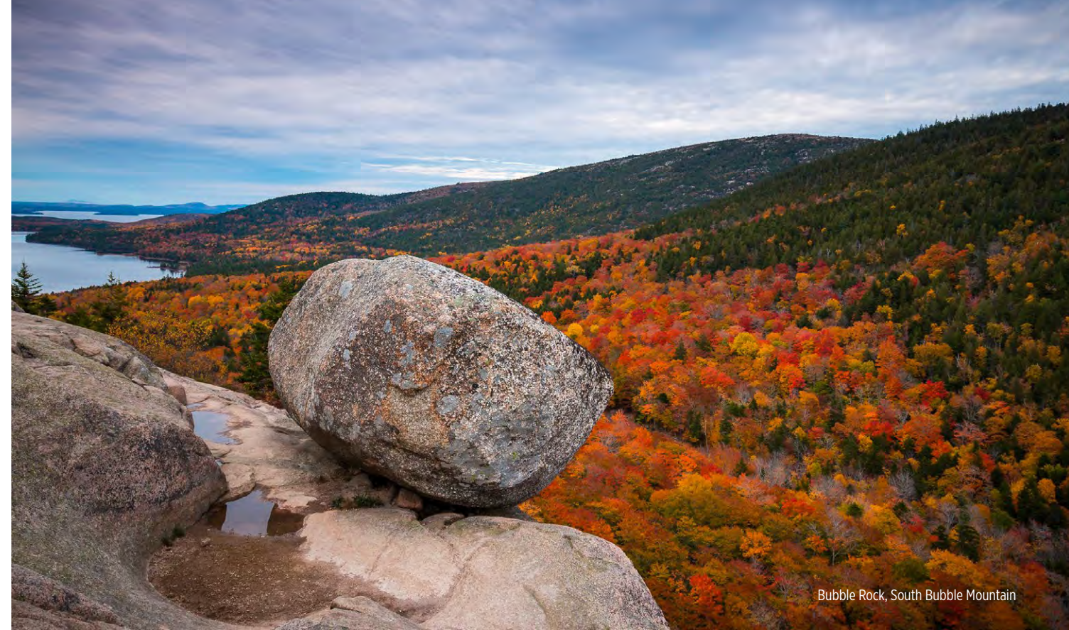
Bubble Rock, South Bubble Mountain

Please note: This itinerary is subject to change based on weather conditions and park closures related to COVID-19.