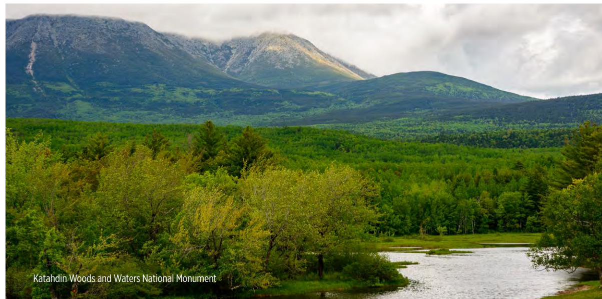
Katahdin Woods and Waters National Monument

Travel Insurance: To protect yourself from the loss of deposit and cancellation fees, you are encouraged to purchase travel insurance. If you need assistance, NPCA recommends contacting Travel Insurance Services through USI Affinity at 1-800-937-1387 or at http://my.travelinsure.com/npc ; email confirmation packets will include additional details.