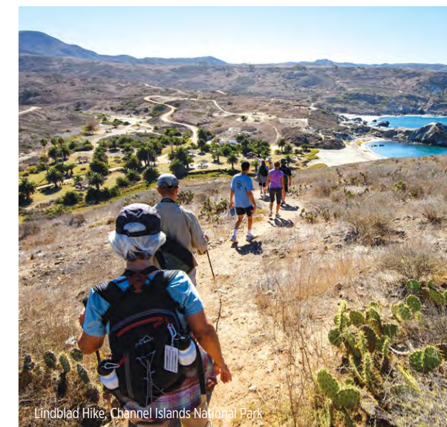
Lindblad Hike, Channel Islands National Park

Please note: This itinerary is subject to change based on weather conditions, the order of the National Park permit allocations and Park sanctioned construction projects on the islands.