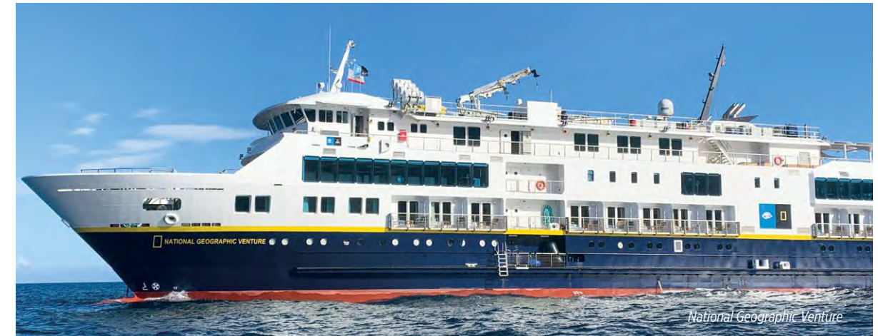
Ship Details: National Geographic Venture

Note: Itinerary and prices listed in this brochure are as of publication date and are subject to change. Under normal conditions the total expedition price is guaranteed at the time of booking. However, the expedition pricing is determined far in advance of initial departure on the basis of then-existing projections of fuel and other costs. In the event of increases in those costs, including but not limited to increases in the price of fuel, currency fluctuations, increases in government taxes or levies, or increased security costs, the right is reserved to adjust the price of your expedition or add a surcharge to cover such unexpected increases. We will always provide an explanation of the reason for increase in costs.