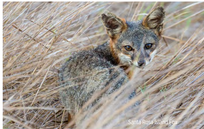
Santa Rosa Island Fox

elusive fox species endemic to the island . Join the naturalists for a more strenuous hike out to the base of the Torrey Pines State Natural Reserve , which contains what is considered one of the world's rarest pines and is one of only two naturally occurring groves in the world. End the day with a sunset cocktail party. (B, L, D)