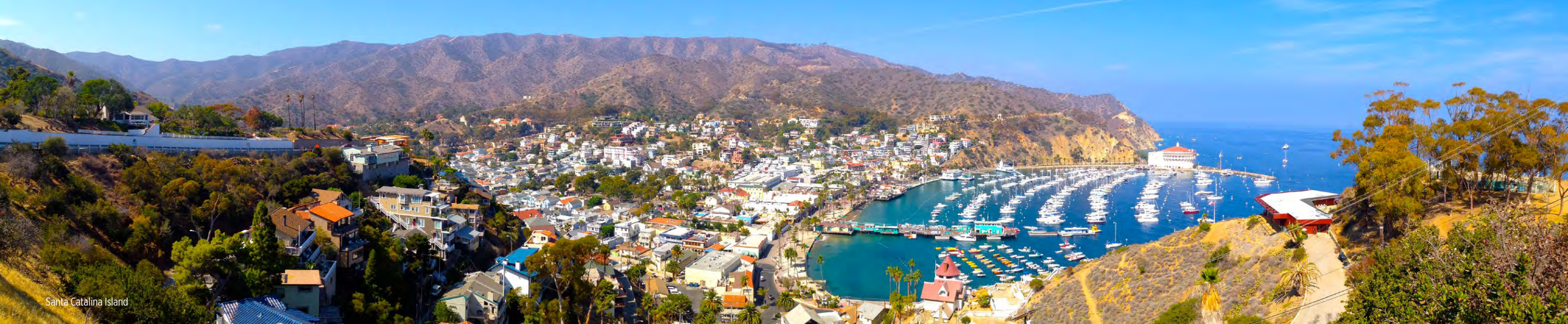
Santa Catalina Island