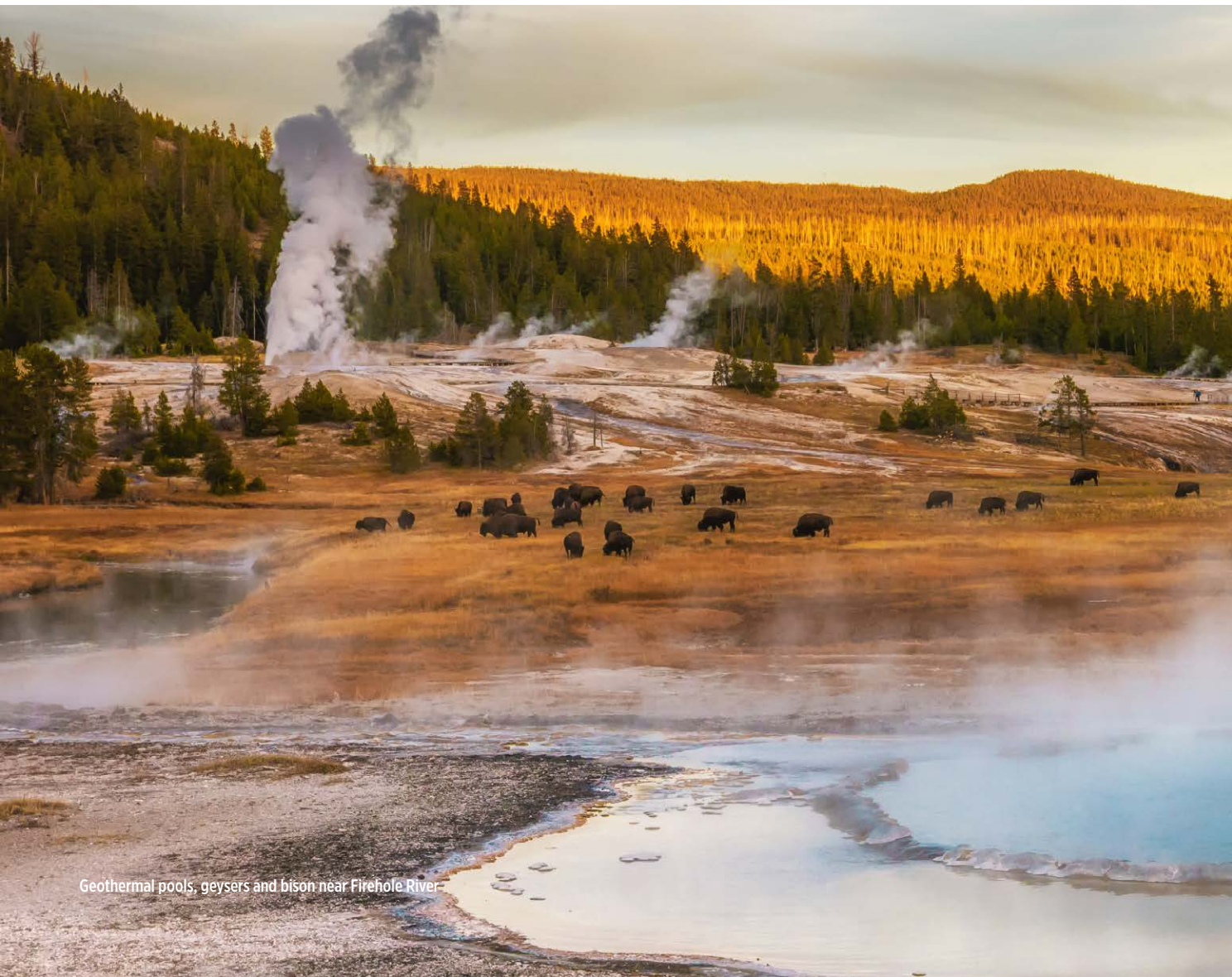
Geothermal pools, geysers and bison near Firehole River

Accommodations and activities are subject to change at any time due to unforeseen circumstances or circumstances beyond NPCA's control.