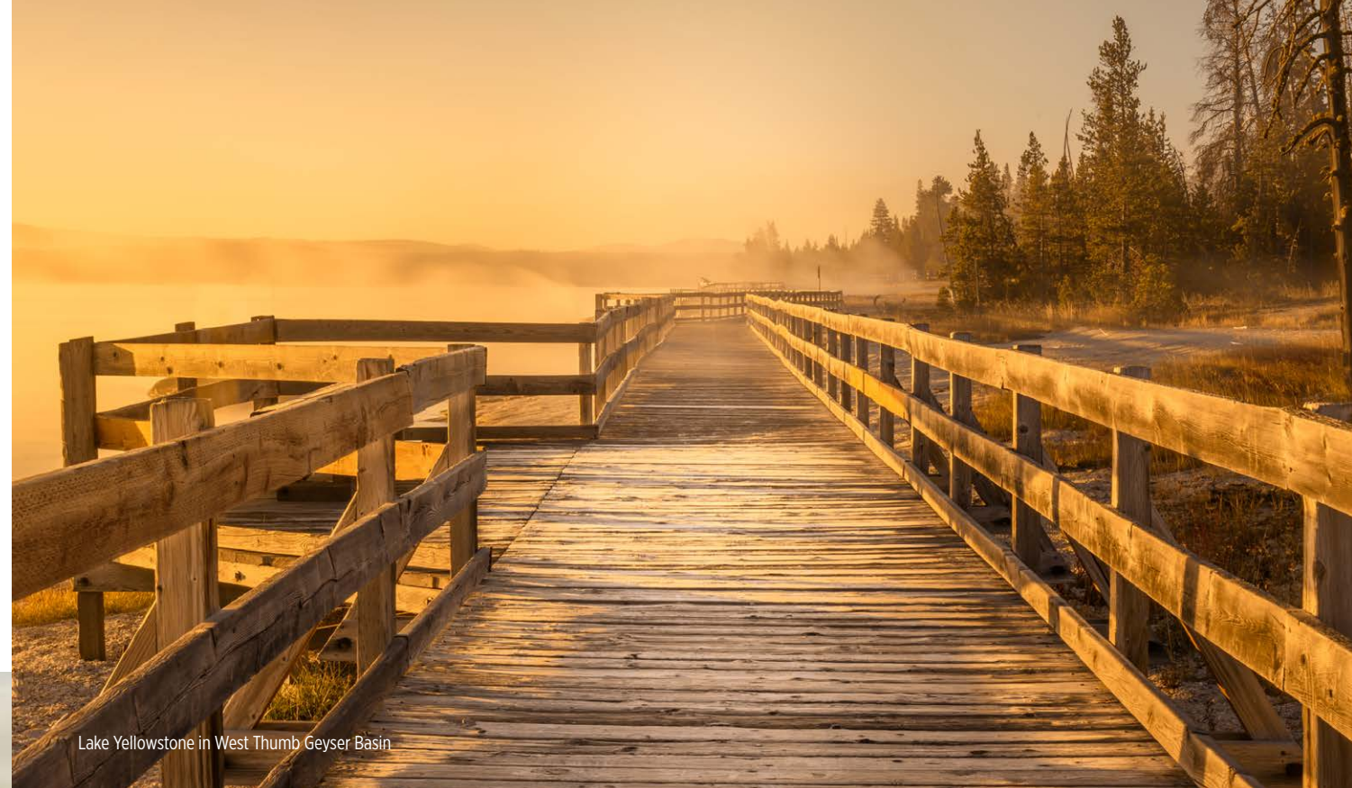
Lake Yellowstone in West Thumb Geyser Basin

Travel Insurance: To protect yourself from the loss of deposit and cancellation fees, you are encouraged to purchase travel insurance. If you need assistance, NPCA recommends contacting Travel Insurance Services through USI Affinity at 1-800-937-1387 or at http://my.travelinsure.com/npca ; email confirmation packets will include additional details.