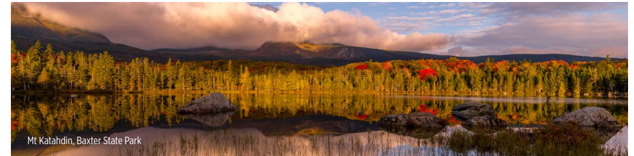
Mt Katahdin, Baxter State Park

Accommodations and activities are subject to change at any time due to unforeseen circumstances or circumstances beyond NPCA's control.