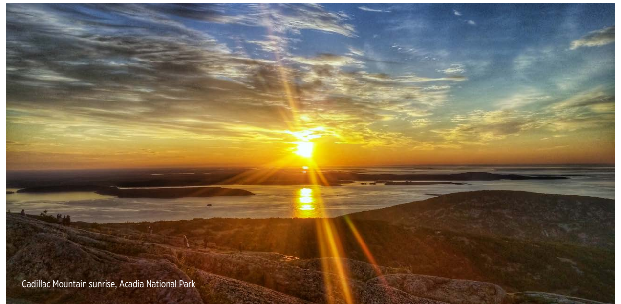
Cadillac Mountain sunrise, Acadia National Park

Starting at the Hulls Cove Visitor Center , we'll hear from NPCA experts and National Park Service staff for an introduction to Acadia. Today, our route is along Acadia's scenic Park Loop Road , with our first stop at Wild Gardens of Acadia and the Jesup Path and Hemlock Path Loop Trail , which winds its way through stands of white birch and hemlock trees. From there, we will continue to Sand Beach , a small inlet between the mountains and rocky shores. We'll see powerful waters at Thunder Hole and start our afternoon hike nearby. Our knowledgeable guide will help us navigate the terrain as we see what makes this area unique and why it is one of the most popular parks in the country. After our hike we'll proceed along Park Loop Road, stopping en route as we make our way to picturesque Jordan Pond . Here, we will have the opportunity to embark on another hike, or simply relax along the water and take in the surrounding landscape. This evening, we'll dine at a local harborside lobster pound. The Inn on Mount Desert (B, L, D)