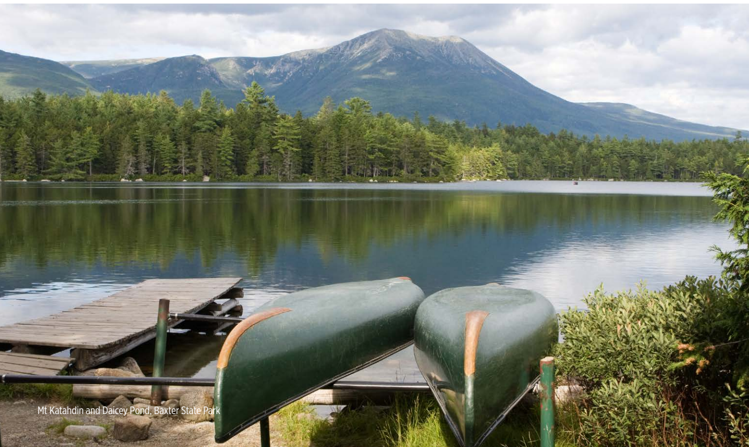
Mt Katahdin and Dacey Pond, Baxter State Park

Travel Insurance: To protect yourself from the loss of deposit and cancellation fees, you are encouraged to purchase travel insurance. If you need assistance, NPCA recommends contacting Travel Insurance Services through USI Affinity at 1-800-937-1387 or at http://my.travelinsure.com/npc ; email confirmation packets will include additional details.