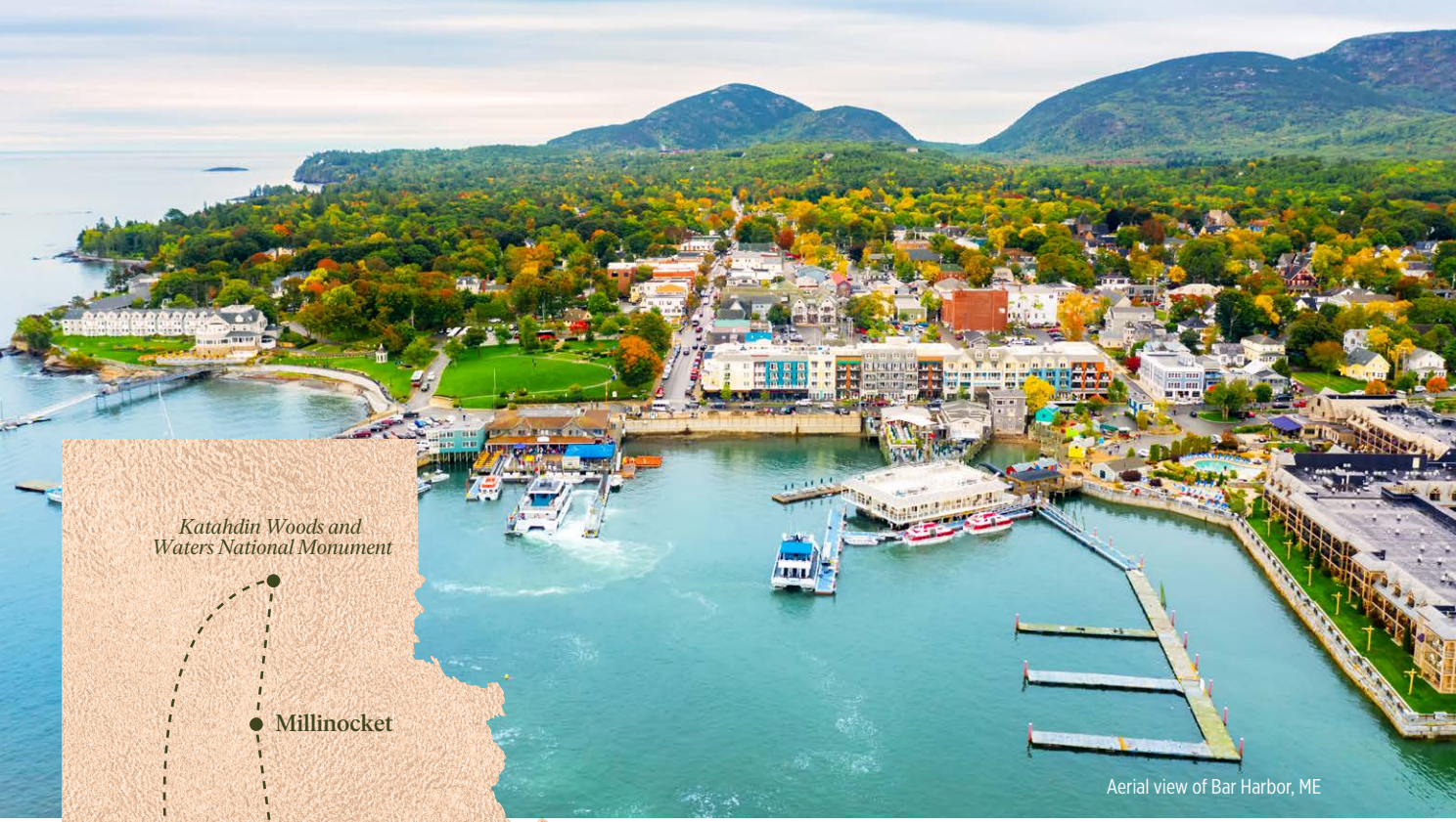
Aerial view of Bar Harbor, ME