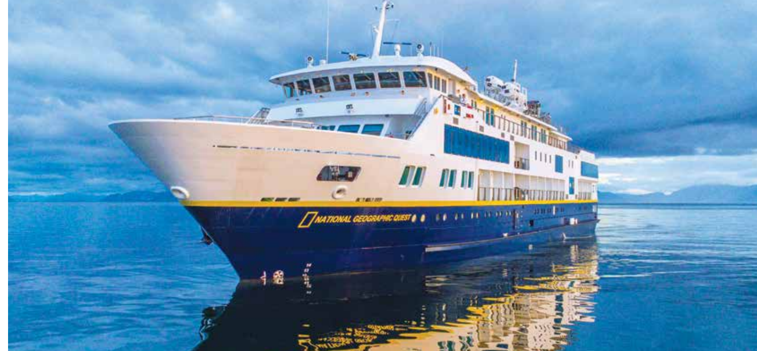
Ship: National Geographic Quest

Each of our travel partners have developed robust safety protocols to protect the health of our guests, staff and the communities we visit. Click here for up-to-date protocols for this trip . Please contact us for details.