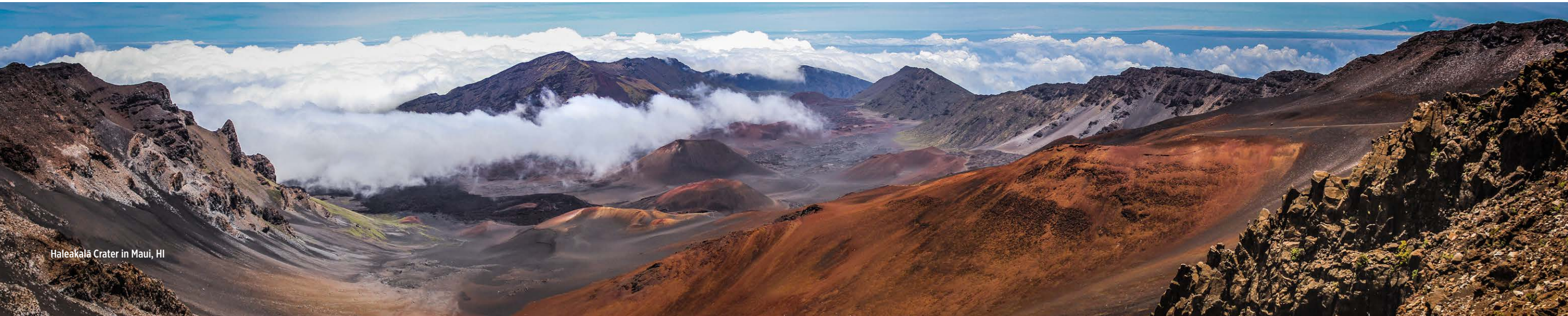
Haleakalā Crater in Maui, HI

Each of our travel partners has developed robust safety protocols to protect the health of our guests, staff and the communities we visit. Please contact us for details.