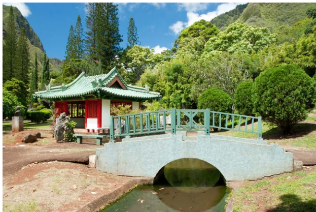
Japanese Garden, ‘Īao Valley State Park, Maui, HI

8 This morning, we will depart on a field trip to Haleakalā National Park , an International Biosphere Reserve . Towering over the island of Maui at 10,023 feet above sea level, Haleakalā Crater is the place for an amazing range of landscapes and skylines. The name Haleakalā means “House of the Sun” in Hawaiian Legend. While taking in the breathtaking views, you’ll learn how NPCA is protecting endangered and vulnerable species in Haleakalā, a park with significant climate concern. After a visit to the summit and the visitor’s center, we will head down to Kula where we will enjoy lunch. Next stop: ‘Īao Valley State Park — a lush green valley and a sacred site to the Hawaiian people. It is the historic location of a fierce battle between Maui warriors and the army of Kamehameha the Great. A Hawaiian Cultural expert will share their knowledge of the valley. We will return to the hotel to freshen up before gathering to depart for our final group dinner together at a local restaurant. Sheraton Maui (B, D)