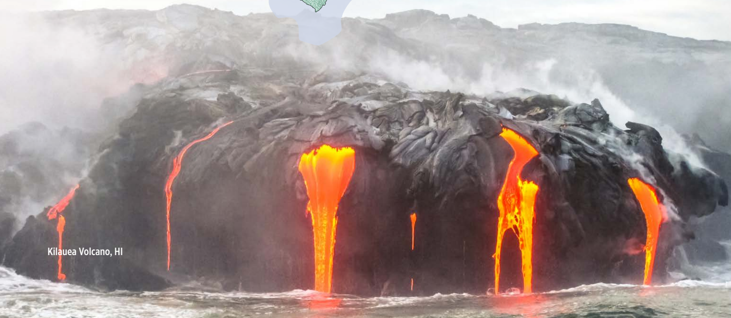
Kilauea Volcano, HI