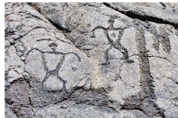
Petroglyph at Hawai'i Volcanoes National Park

After breakfast, an expert guide will take you on a hike through a native rainforest down to the floor of Kilauea caldera and back, a distance of 1.5 miles. View the park's efforts on non-native plant eradication and see how well the native pa'iniu (lily) and endemic ferns are coming back. There is an optional 0.5-mile detour via Sandalwood Trail , which includes passing active steam vents enroute back to the Volcano House hotel. After the hike, everyone will have time to have lunch and rest or explore before we travel in vans to traverse the 20-mile long Chain of Craters Road — an extraordinary scenic