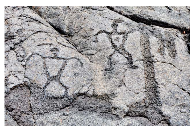
Petroglyph at Hawai'i Volcanoes National Park

After breakfast, head out to explore the wonders of the youngest of Hawai'i's main islands. Spend the day exploring Hawai'i Volcanoes National Park with an expert volcanologist. Drive through the Steam Vents area, then visit the overlook into Kīlauea Caldera. Continue onto Devastation Trail, which was formed in 1959 as a result of an eruption from the Kīlauea Iki crater. Walk through the surrounding 200-year-old forest which was buried by ashes and see how much (or how little) growth has come back. Walk through a lush rainforest to Nāhuku (Thurston) Lava Tube before exploring on your own before a group dinner. Volcano House (B. L. D)