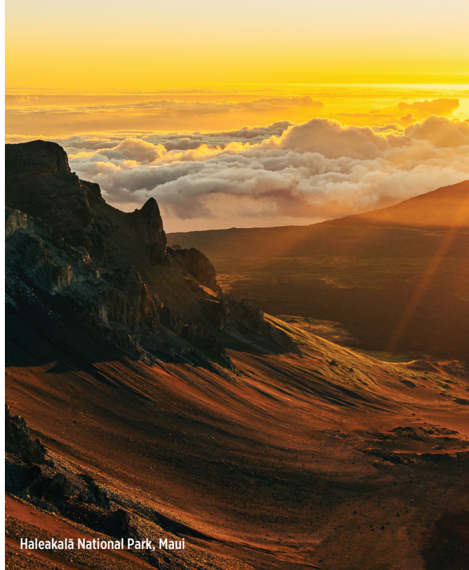
Haleakalā National Park, Maui