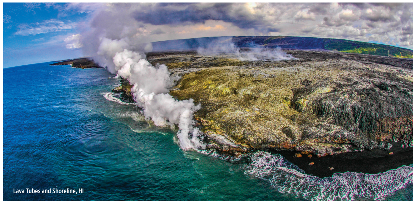
Lava Tubes and Shoreline, HI