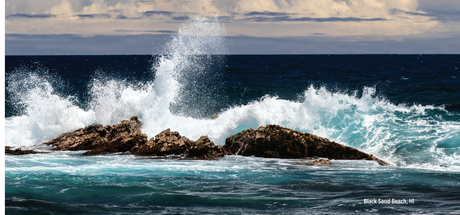
Black Sand Beach, HI

Please note: Kalaupapa is tentative as of summer 2024 due to Department of Health related closures. If the park does not open, we will visit other areas on Moloka'i.