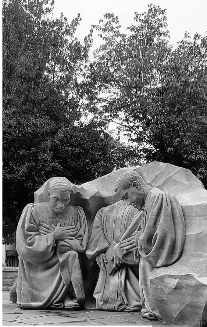
HISTORIC MARKER IN HONOR OF ELMORE BOLLING Lowndesboro, AL