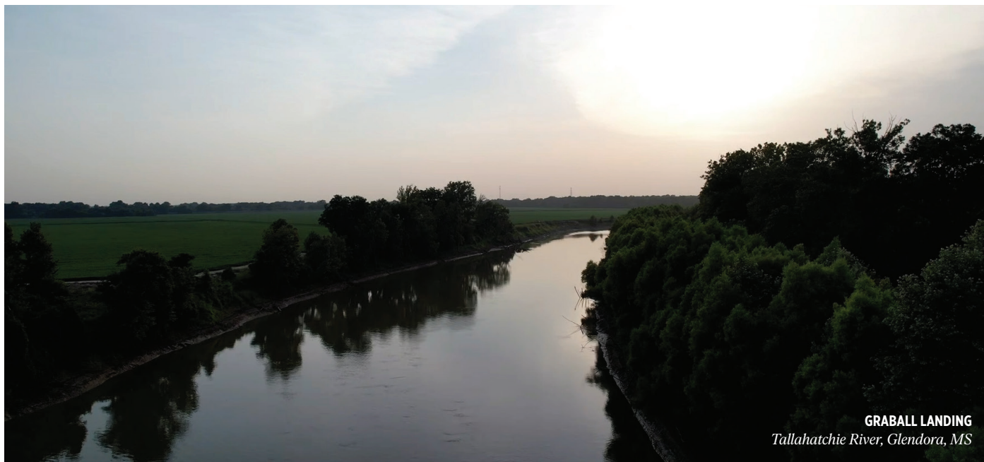
GRABALL LANDING Tallahatchie River, Glendora, MS