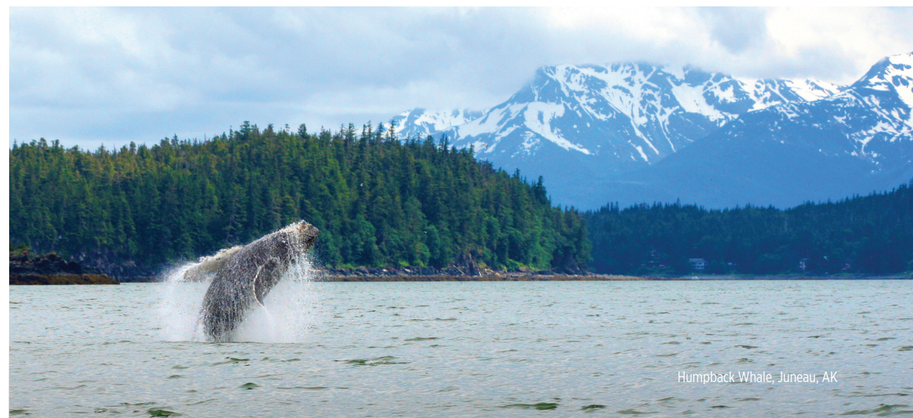
Humpback Whale, Juneau, AK

5 These waters are prime areas for both orca and humpback whales. With luck, we may observe their fascinating behavior — breaching, tail-slapping and variations on feeding — as we fill the deck and listen to the play-by-play from our expert naturalists. We will explore spectacular bays and inlets, following bear trails and salmon streams. Once ashore, we can walk along a quiet forest trail. The still waters are excellent for kayaking, offering another option for up-close exploration. (B, L, D)