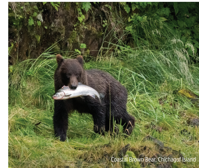
Coastal Brown Bear, Chichagof Island