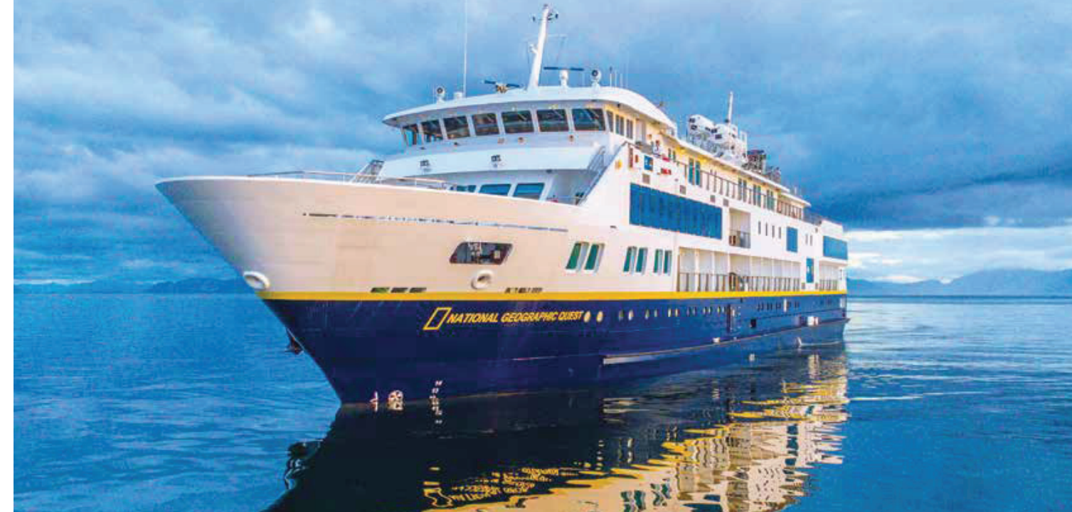
Ship: National Geographic Quest

Note: Prices quoted in this brochure are per person based on double occupancy in USD. Prices quoted are valid at the time of publication, and are subject to change and availability at time of booking. Under normal conditions the total expedition price is guaranteed at the time advanced payment is made. However, our expedition pricing is determined far in advance of initial departure on the basis of then-existing projections of fuel and other costs. In the event of increases in those costs, including but not limited to increases in the price of fuel, currency fluctuations, increases in government taxes or levies, or increased security costs, we reserve the right to adjust the price of your expedition or add a surcharge to cover such unexpected increases. We will always provide an explanation of the reason for increase in costs.