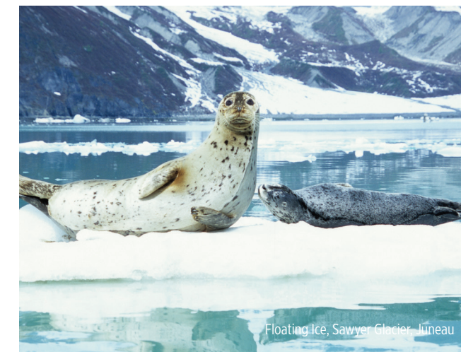
Floating Ice, Sawyer Glacier, Juneau

Activities are subject to change at any time due to unforeseen circumstances or circumstances beyond NPCA's control.