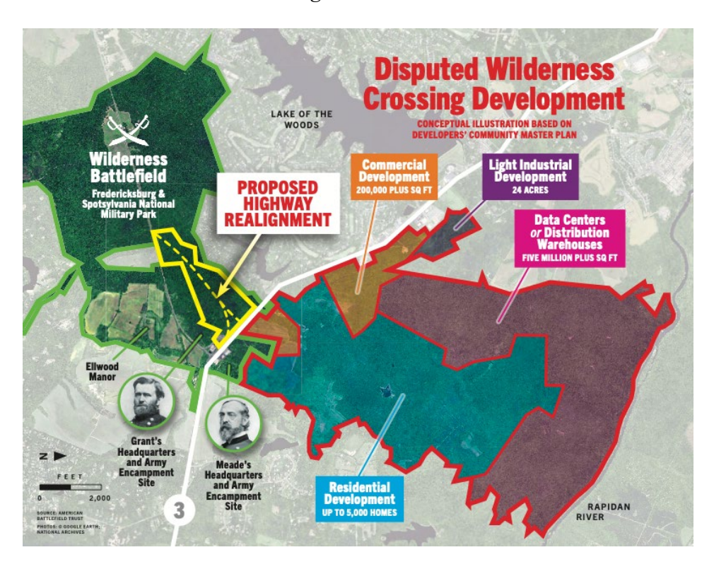
Figure 2: Map of proposed Wilderness Crossing development adjacent to the Wilderness Battlefield<sup>19</sup>

Wilderness Crossing despite outpouring of opposition, April 26, 2023.<sup>17</sup> The project proposes construction of 5000 houses, 750 acres of industrial development, and hundreds of acres of commercial development. Despite the proposed development's proximity to the historic Wilderness Battlefield, no analyses of impacts – whether direct or indirect – to historic and cultural resources or the environment were conducted. <sup>18</sup> See Figure 2.