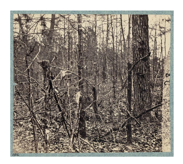
Figure 1 Wilderness Battlefield (1865)

Named for its natural character – a patchwork of fields and forest representative of the local ecology – the Wilderness Battlefield shaped the historic events it played host to in unique ways. Waged from May 5 to May 7 of 1864, the Battle of the Wilderness was the first meeting of Union Lieutenant General Ulysses S. Grant and Confederate General Robert E. Lee and marked the first major engagement of the Union's Overland Campaign to the Confederate capital of Richmond.