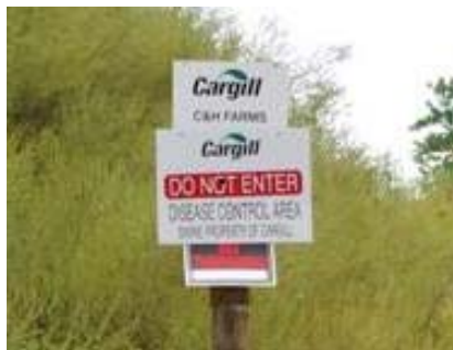
Photograph of Sign at C&H

C&H is contracted with Cargill, one of the world's largest privately-owned businesses, which had sales and other revenues of $136.7 billion in fiscal year 2013 alone. 4 Despite this, C&H put taxpayers on the line for $3.4 million in federal loan guarantees in order to obtain a loan for construction. 5