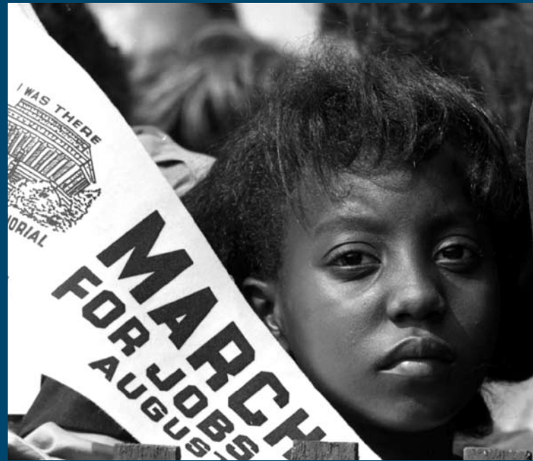
Left: Crowds stretch out along the National Mall between the Lincoln Memorial and the Washington Monument.