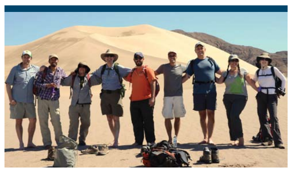
Above: Members of NPCA's Pacific Regional Council joined staff in March 2013 for a three day visit to Death Valley National Park. The more adventuresome members of the group tackled an ambitious dune hike.