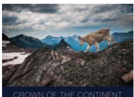
CROWN OF THE CONTINENT The Wildest Rockies

It's been said that the world is run by those who show up.