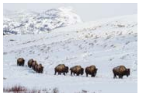
Top: Bison in Yellowstone National Park. Above: A small herd of bison follow a snow covered trail in Yellowstone National Park.