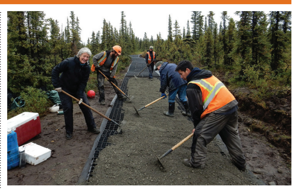
Above: Working to repair Caribou Creek Trail in 2014

This trail leads to a public-use cabin as well as recreation, subsistence and sport opportunities in the national preserve. It's a popular destination for park visitors and local residents. In 2014, NPCA partnered with the Park Service and SCA to repair about 900 feet of the trail that had been damaged by legal, yet poorly managed, off-road vehicle use. Our sincere thanks to the Rasmuson Foundation for providing purchasing power for the Geoblock and gravel we're installing to create a durable and sustainable Caribou Creek Trail.