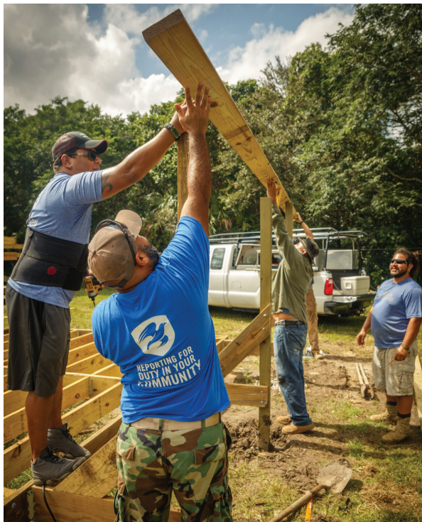
Above: NPCA Mission Continues veteran volunteers reconstruct camping platforms for school groups at Shark Valley in Everglades National Park. ©Jacqueline Cruet | NPCA Right: NPCA Adaptive Aquatics volunteers monitor bronze trail markers along the Maritime Heritage Trail in Biscayne National Park ©Serena Branagan/NPCA.