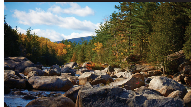
Katahdin Woods & Waters National Monument, Maine