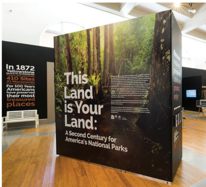
Above: "This Land Is Your Land: A Second Century for America's National Parks" on view through January 8th at the Coral Gables Museum.

This Land is Your Land: A Second Century for America's National Parks explores the National Park Service's museum collection in South Florida. Exhibition is sponsored by NPCA.