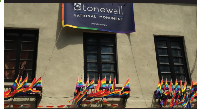
Stonewall National Monument, New York