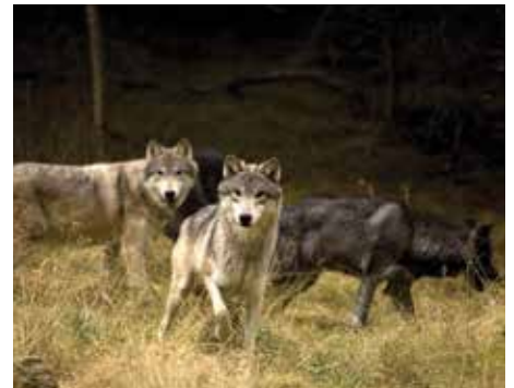
Top: Alaska Peninsula brown bear sow with cubs. Above: Curious group of gray wolves, Denali National Park

any public meetings. Please help us tell NPS that protections for bears and wolves must stand.