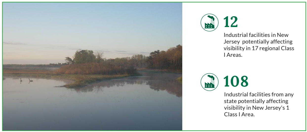
Views across the water at Brigantine Wilderness Area, NJ. NPCA analysis of impact of industrial facilities based on publicly available emissions data from the EPA's 2017 National Emissions Inventory (NEI) and the 2019 Air Markets Program Data (AMPD).

New York already submitted its plan to the Environmental Protection Agency (EPA) specifying the pollution reducing measures it will require to make progress towards natural visibility, but we urge EPA to ensure the plan is strengthened.