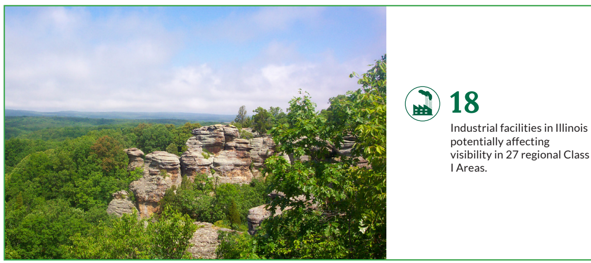
View of Garden of the Gods in Shawnee National Forest, Illinois. NPCA analysis of impact of industrial facilities based on publicly available emissions data from the EPA's 2017 National Emissions Inventory (NEI) and the 2019 Air Markets Program Data (AMPD).

In order to meet this requirement, Illinois must submit its plan to the Environmental Protection Agency (EPA) by July 2021 specifying the pollution reducing measures it will require to make progress towards natural visibility.