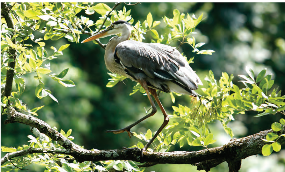
Top Left: Family canoes along the New York section of the Delaware River Middle Left: Customs House at Salem Maritime National Historic Site Middle Right: Friendship of Salem at Salem Maritime National Historic Site Left: Iconic American species, like the Great Blue Heron will benefit from provisions contained in the New York-New Jersey Watershed Protection Act