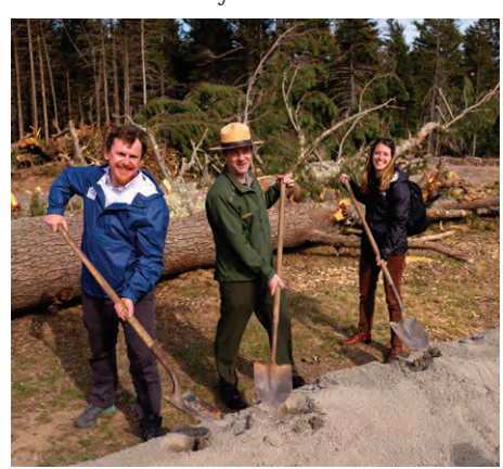
Left: Acadia National Park, ME ©Pat and Chuck Blackley | Alamy Top: New facility rendering ©NPS Above: NPCA and NPS staff at Acadia maintenance facility groundbreaking ©NPCA

an additional five years to ensure our parks can continue to welcome visitors and protect the natural and cultural resources that tell our nation's history.