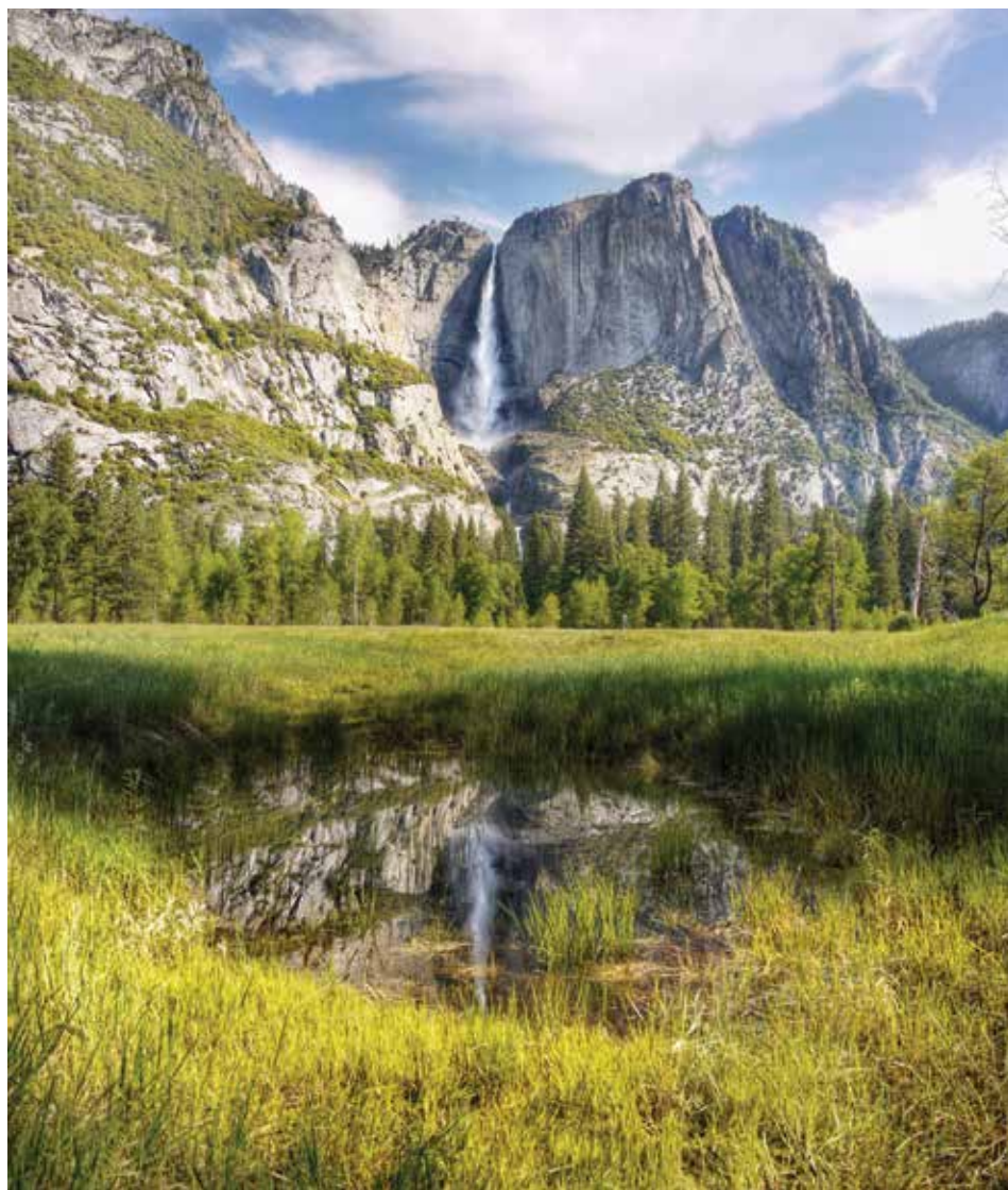
Above: Yosemite Valley view, National Park, California