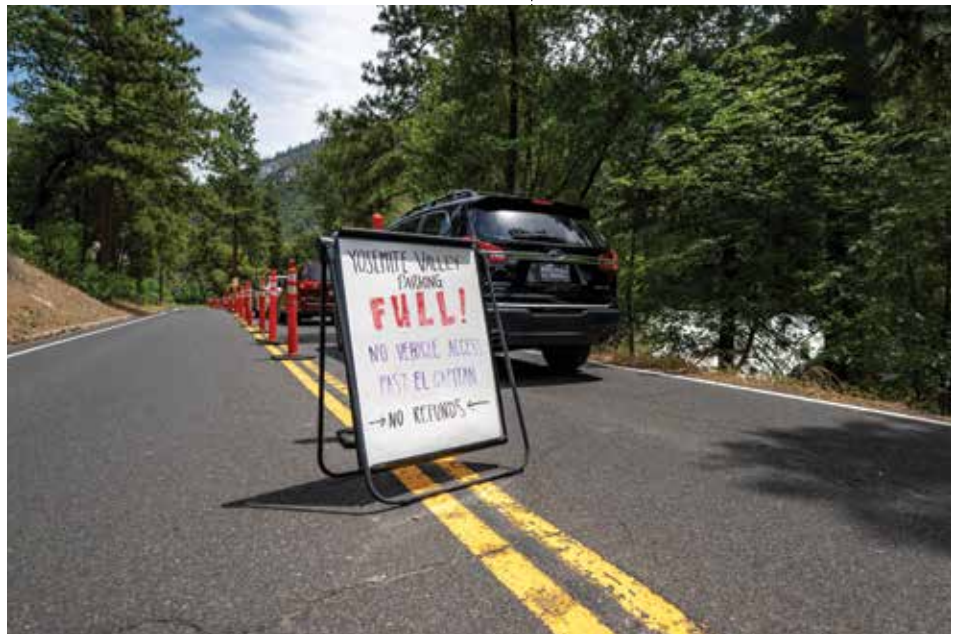
Top: Crowds overlooking tunnel view in Yosemite Above: Sign closing Yosemite Valley to additional cars Below: Traffic Jam in Yosemite Valley